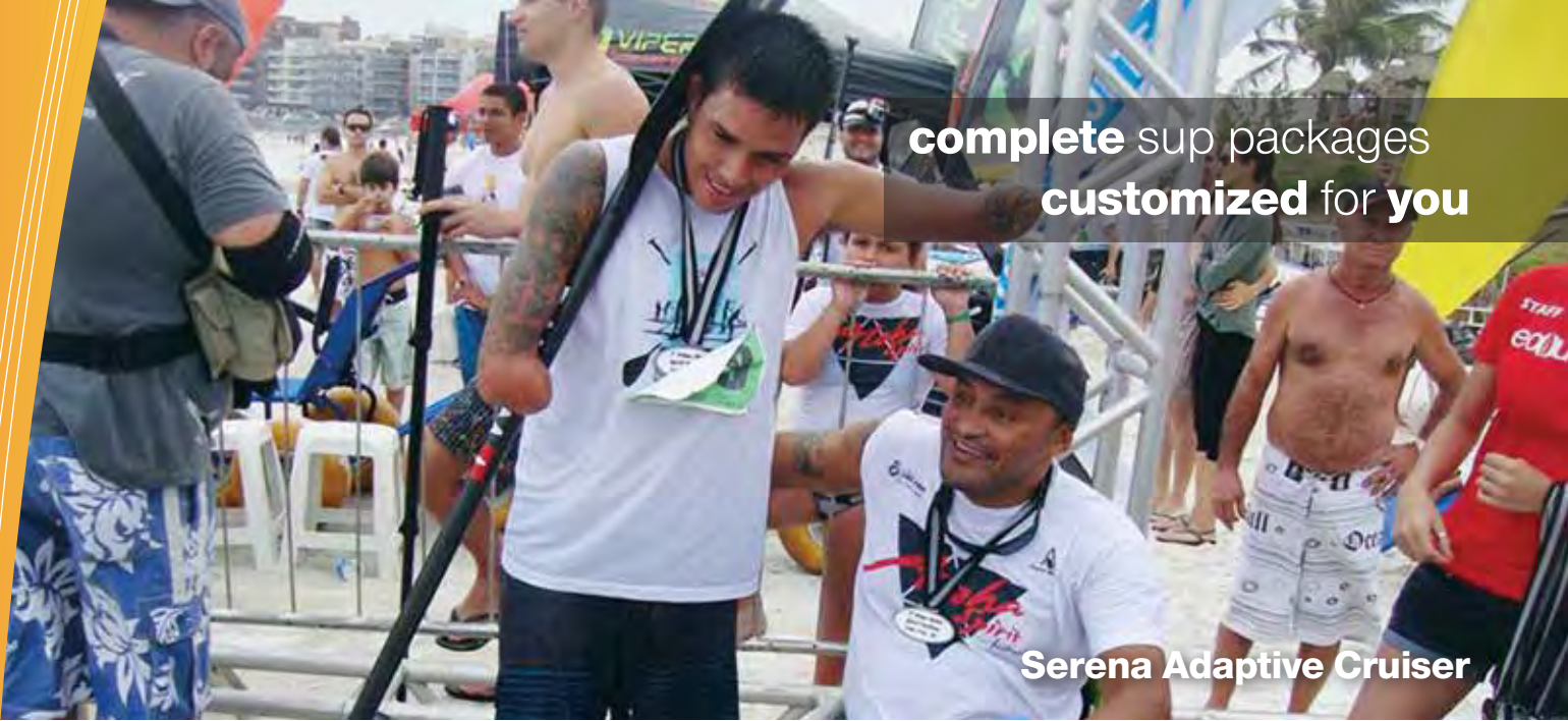
Serena Adaptive Cruiser

complete sup packages customized for you