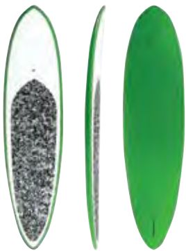
Serena Classic Hard Top SUP