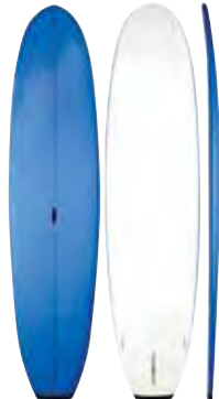
Serena Cruiser Soft Top SUP